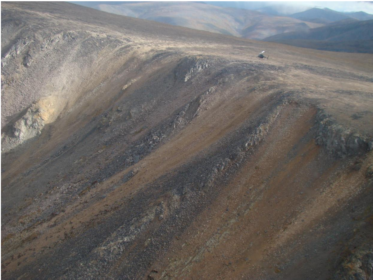
ROSIE CLAIM GROUP: Highly silicified altered quartz feldspar porphyry at the top of the Ruby Range batholith, likely the result of a high sulphidation epithermal system. View south, helicopter for scale.