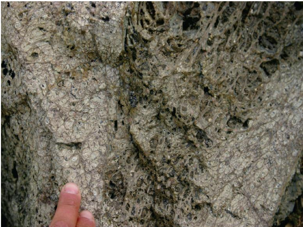
ROSIE CLAIM GROUP: Massive Silicification of Rhyolite Creek Quartz – Feldspar Porphyry