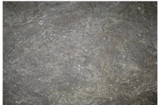
Figure 2: Upper Left – Main Sub-station taking power off the National Grid. Upper Right – Site infrastructure – magazine, Underground fleet service area. Lower Left – Main Portal. Lower Right – Massive sulphide mineralization – Level 2 Magistral North.