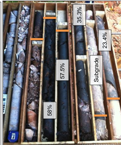
Plot of Mn vs. (SiO 2 +Al 2 O 3 ) for assay results received to date, showing the relationship between manganese grade and silicate content related to the host granite (left). DDH_J3_001 intersection (right), showing high-grade massive manganese with marginal lower grade breccia zone. Sample boundaries in orange.